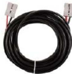
5M Anderson Extension Lead