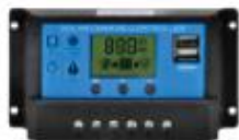
20 Amp PWM Regulator