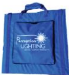
Flexible Folding Solar Blanket